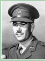
Sir Roden Cutler VC