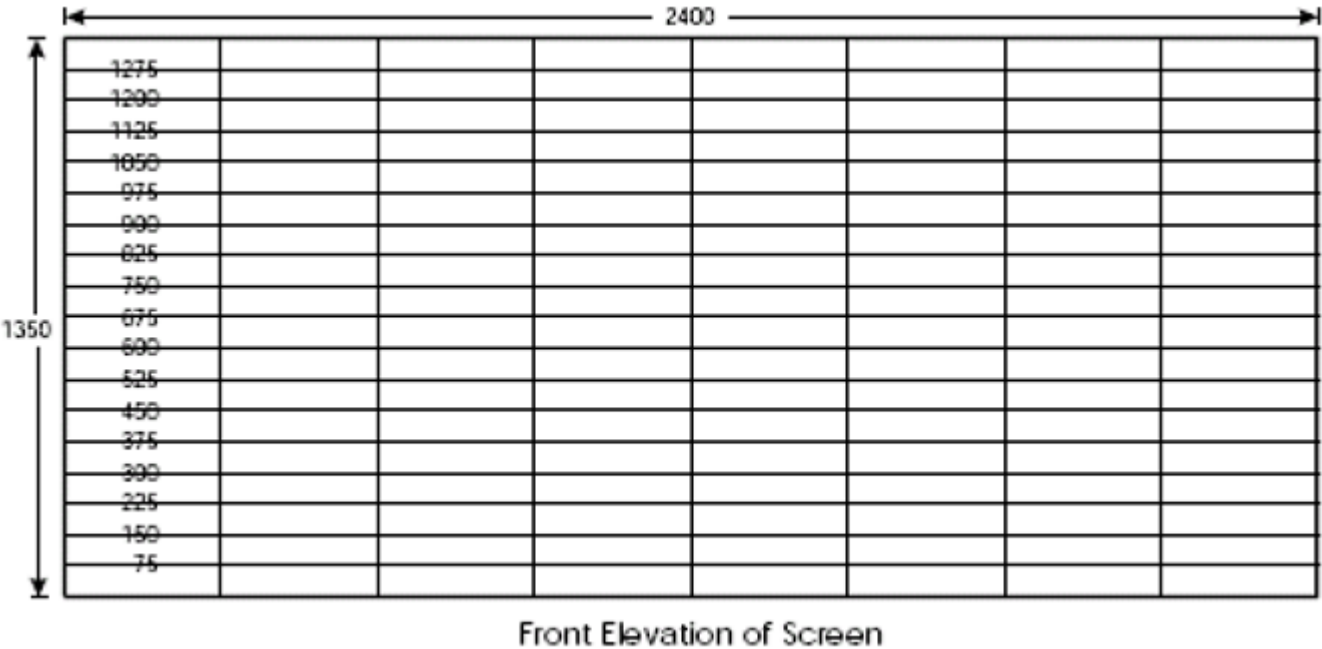
Headlight testing screen showing size of marking on the screen

2.1. The surface of the screen should be ‘flat’ white (gloss finish should be avoided). The screen shall be at least 1300 mm in height and 2400 mm in width (screens for use with motorcycles only may be 1300 mm in height and 1200 mm in width) and shall be marked with horizontal and vertical lines. Horizontal lines shall be spaced 75 mm apart and vertical lines shall be spaced 300 mm apart. Horizontal lines shall be labelled with their height from the bottom of the screen.