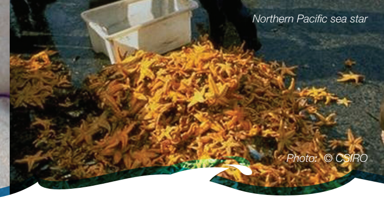
Northern Pacific sea star