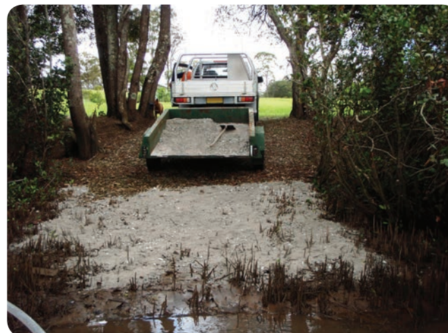
Illegal mangrove clearing for boat access