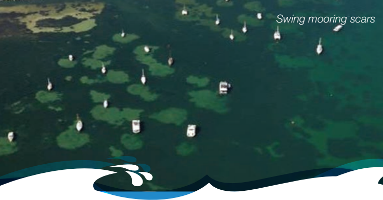
Swing mooring scars