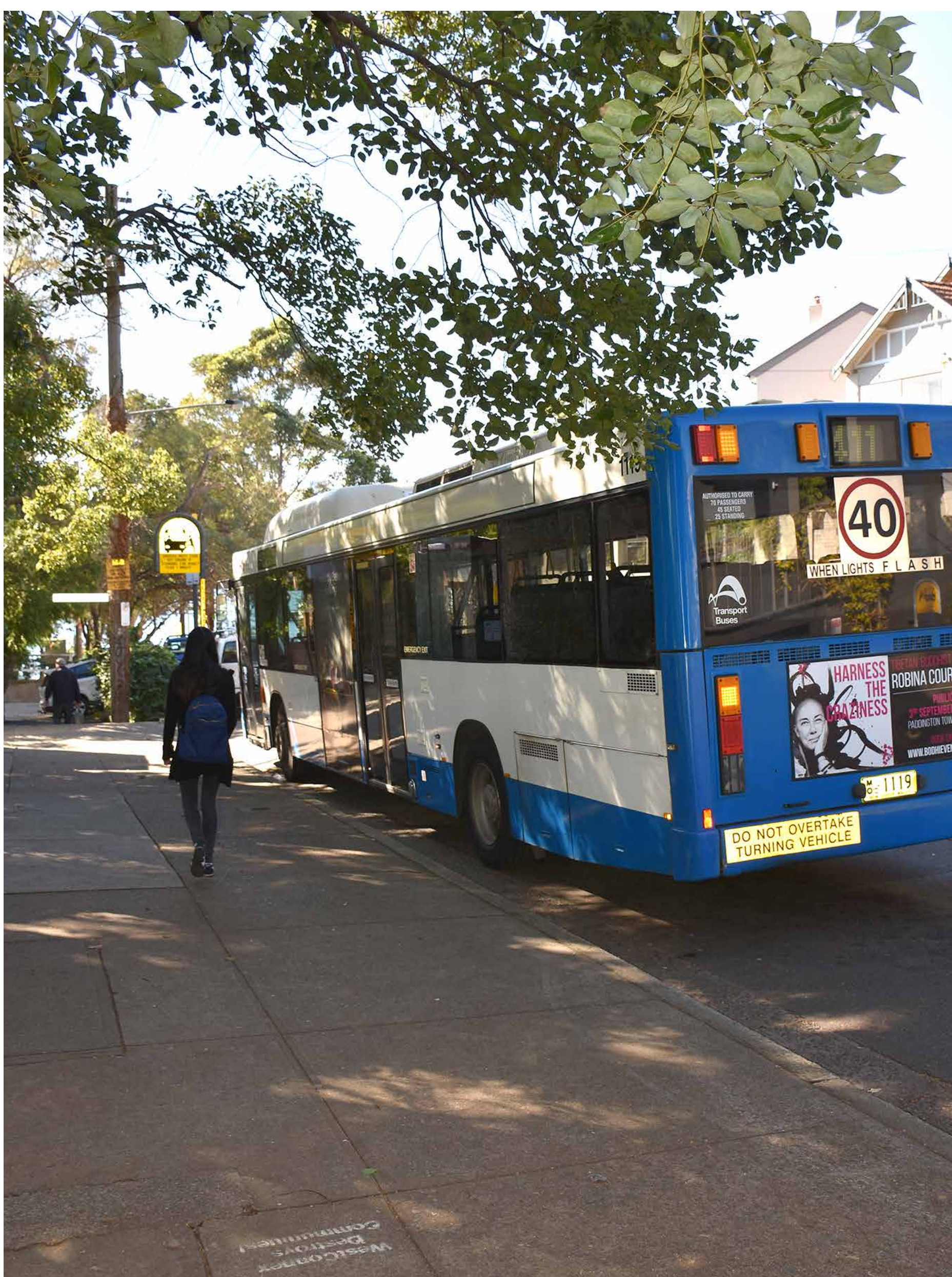
Bus stop at Grove Street

We encourage customers to plan their trip by visiting transportnsw.info or calling 131 500 before starting their journey. Customers will need to allow extra time for their journey.