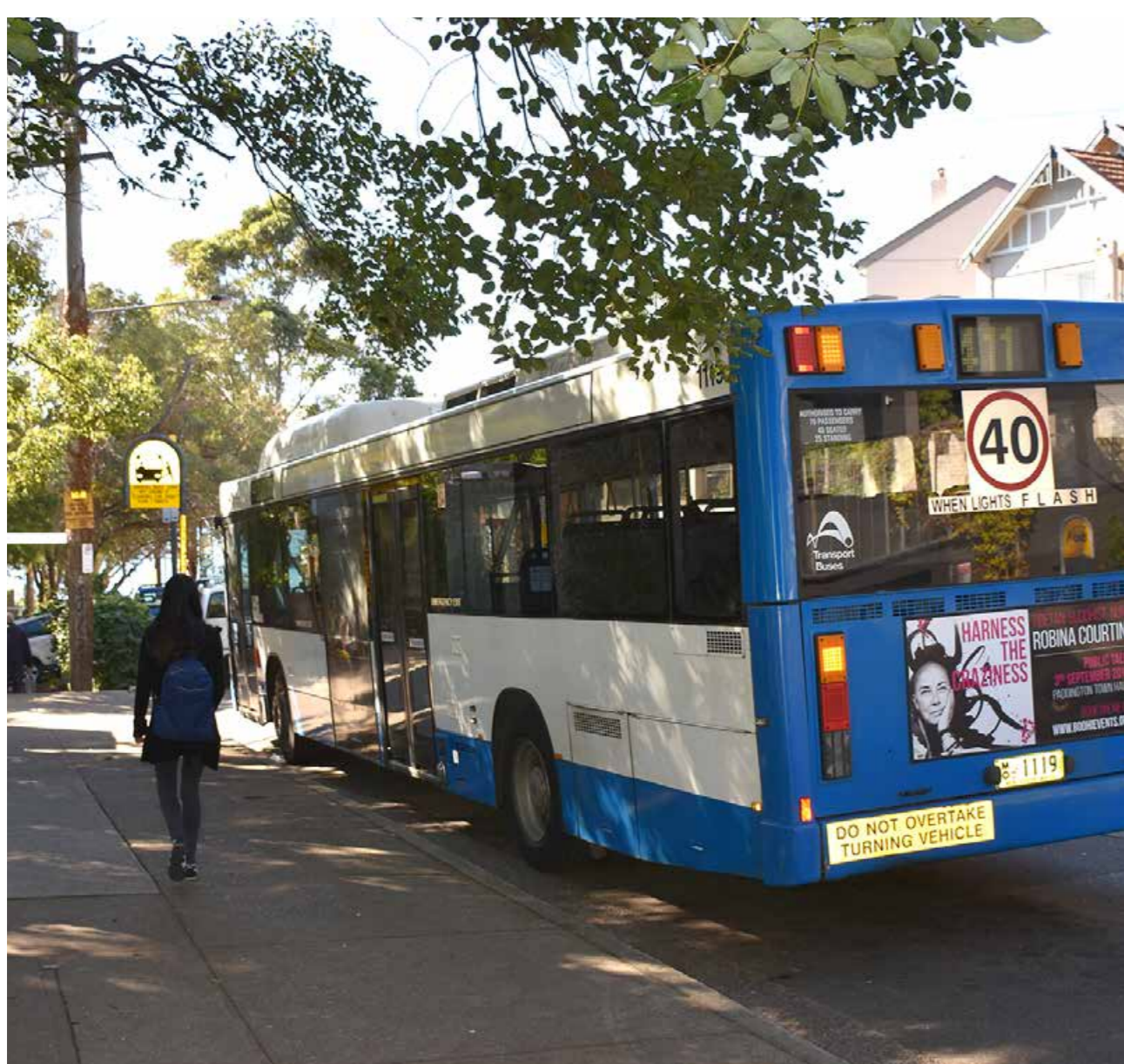
Bus stop at Grove Street

Visit the Roads and Maritime Services website: rms.nsw.gov.au/wharfupgrades