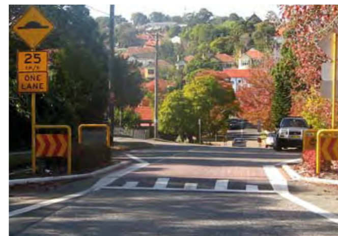
Example of kerb blister and traffic calming measures

The maps can also be viewed in high-resolution on the RTA website, and comment forms and a survey can be downloaded. These can be faxed or mailed (post free) to the study team.