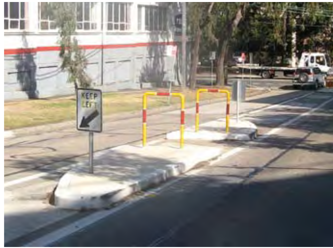
Example of pedestrian refuge