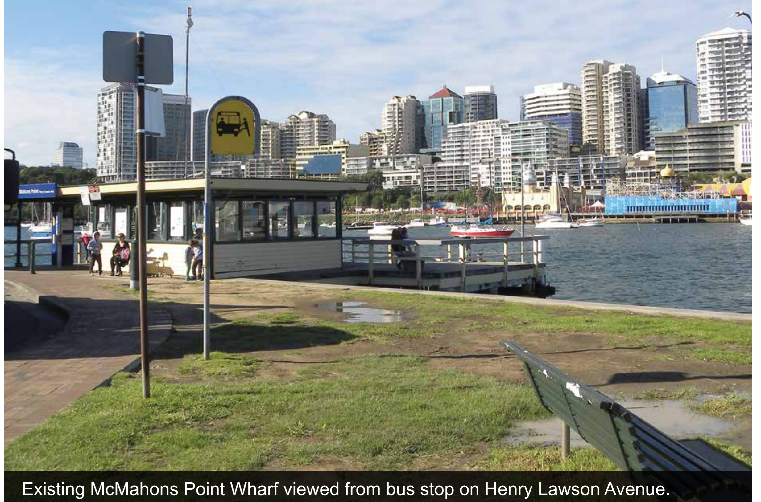
Existing McMahon's Point Wharf viewed from bus stop on Henry Lawson Avenue.