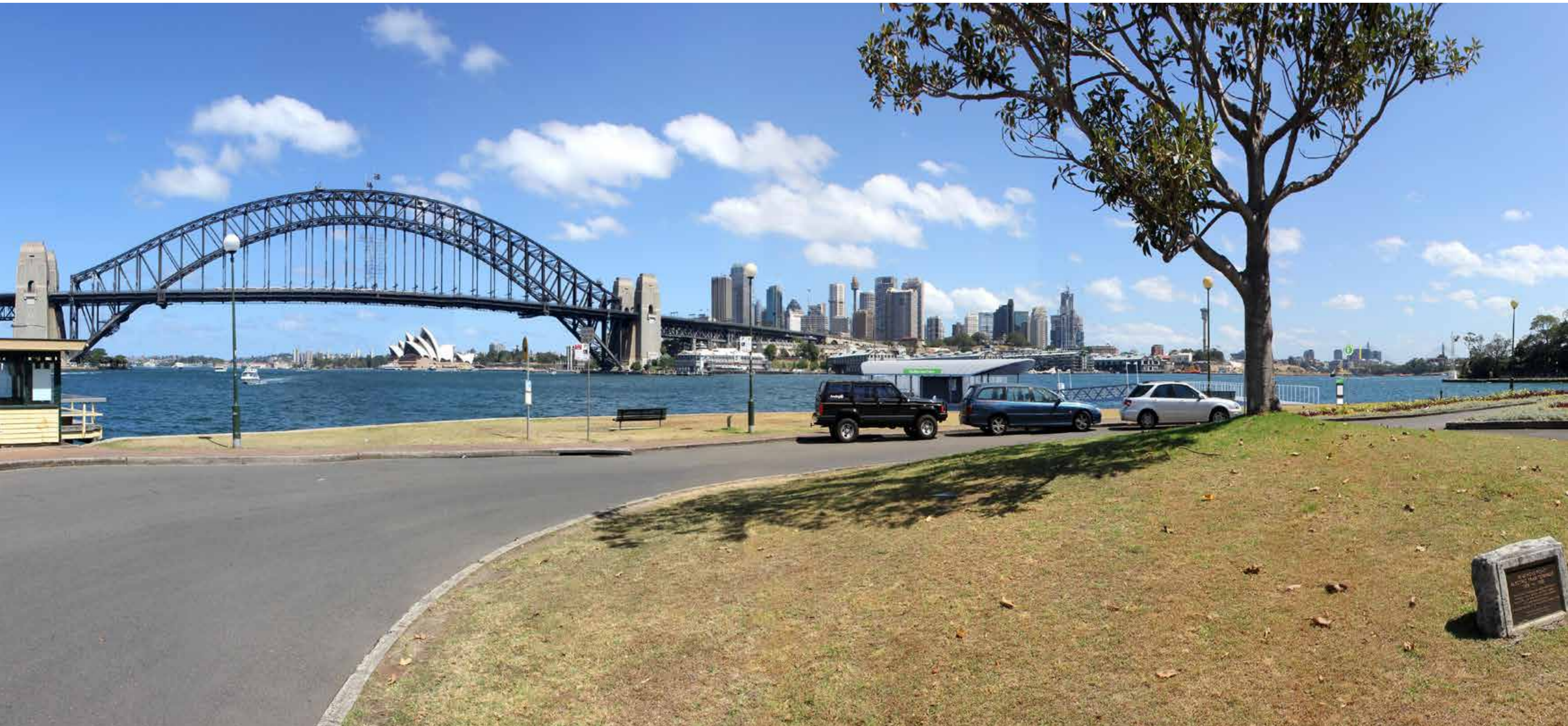
Artist's impression of new McMahon's Point Wharf with view to Sydney Harbour Bridge.

NSW Roads and Maritime Services has a statutory responsibility to assess the environmental, social and economic impacts of its infrastructure projects as part of the planning approvals process.