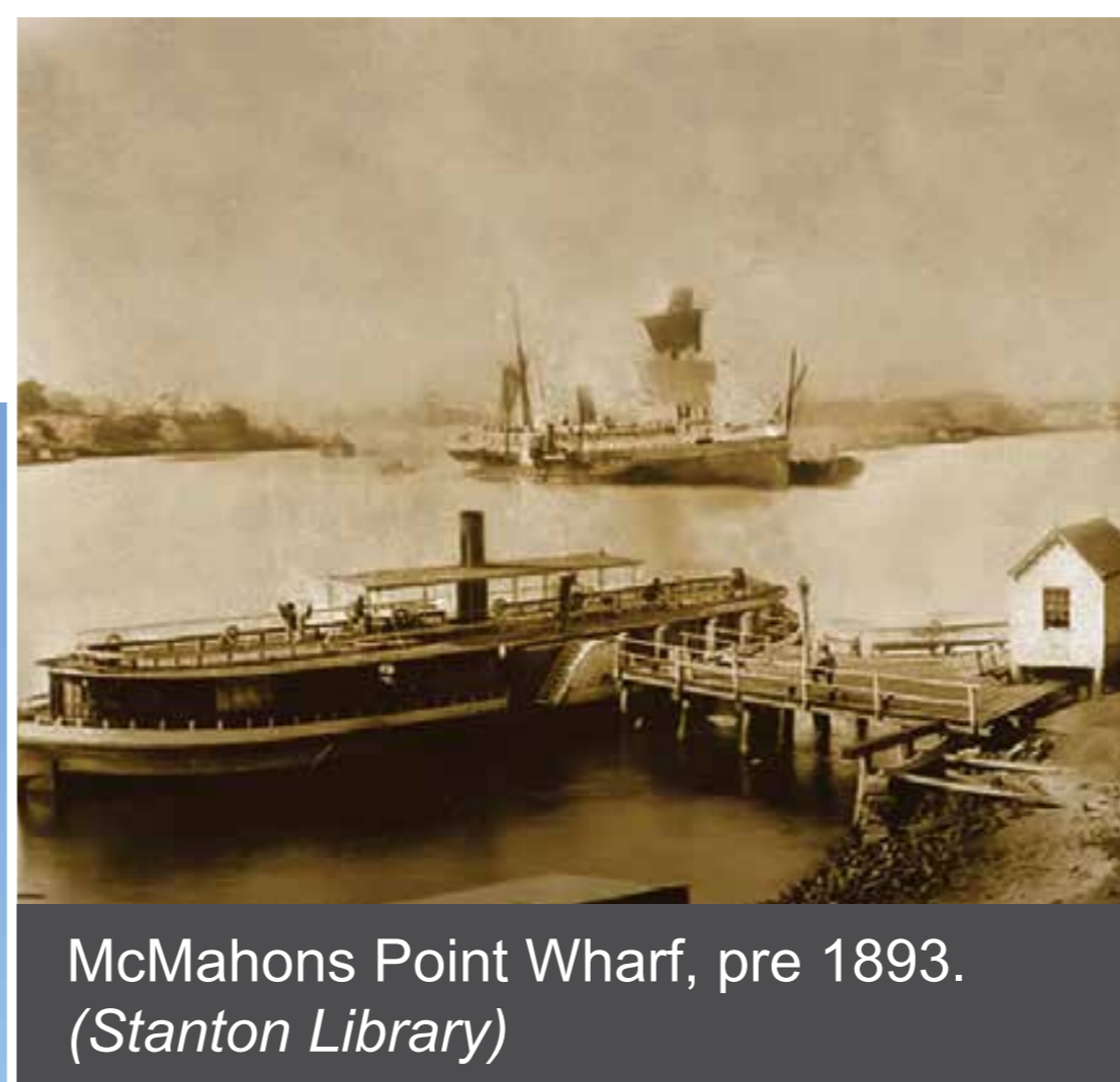
McMahon's Point Wharf, pre 1893.

The highly scenic visual setting also adds to the significance of the wharf. The new wharf design, including choice of materials, aims to minimise any potential visual impact by using neutral colours and transparent materials which are low in reflectivity and complement the adjacent features of the land and water.