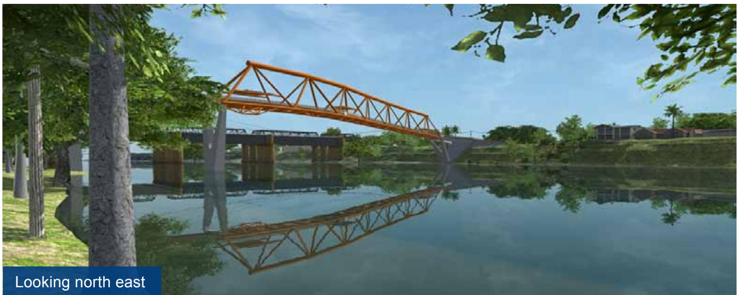
Looking north east