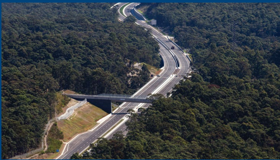
The Hunter Expressway travels through the picturesque Sugarloaf Range.

Continue on the New England Highway towards the Upper Hunter, a rural area that fuses farming, wineries, horse rearing and heavy industry.