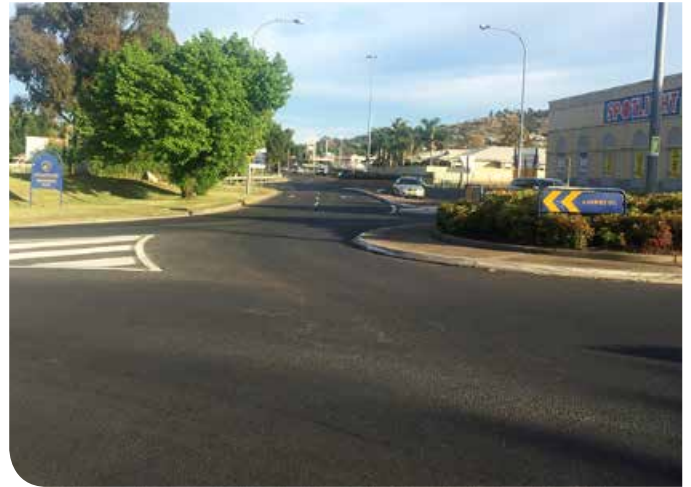
Planning is underway to upgrade the Jewry Street intersection on Manilla Road (Peel Street)

The 2017-18 State Budget included $150,000 to develop plans to upgrade the Jewry Street intersection on Manilla Road. Planning is progressing for this project, including surveying, traffic modelling and other investigations.