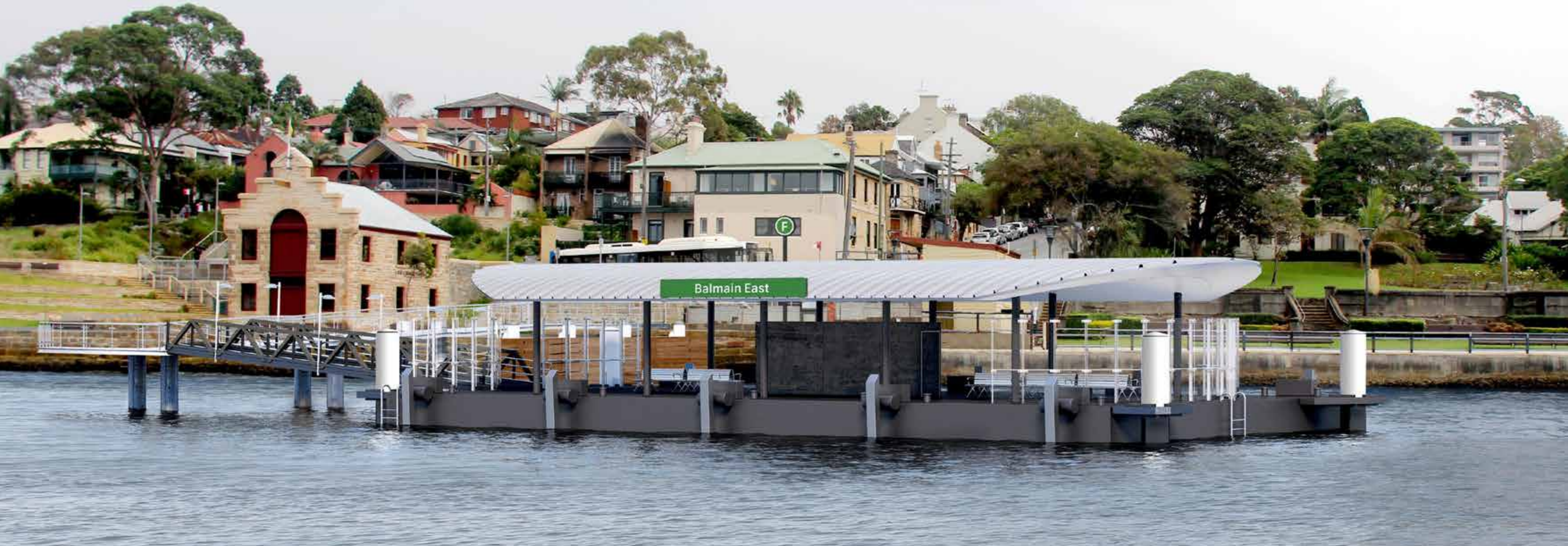
The new Balmain East Wharf viewed from the water – artist's impression for illustrative purposes.

The existing wharf will be replaced by a completely new structure designed to provide customers with improved access and amenity.