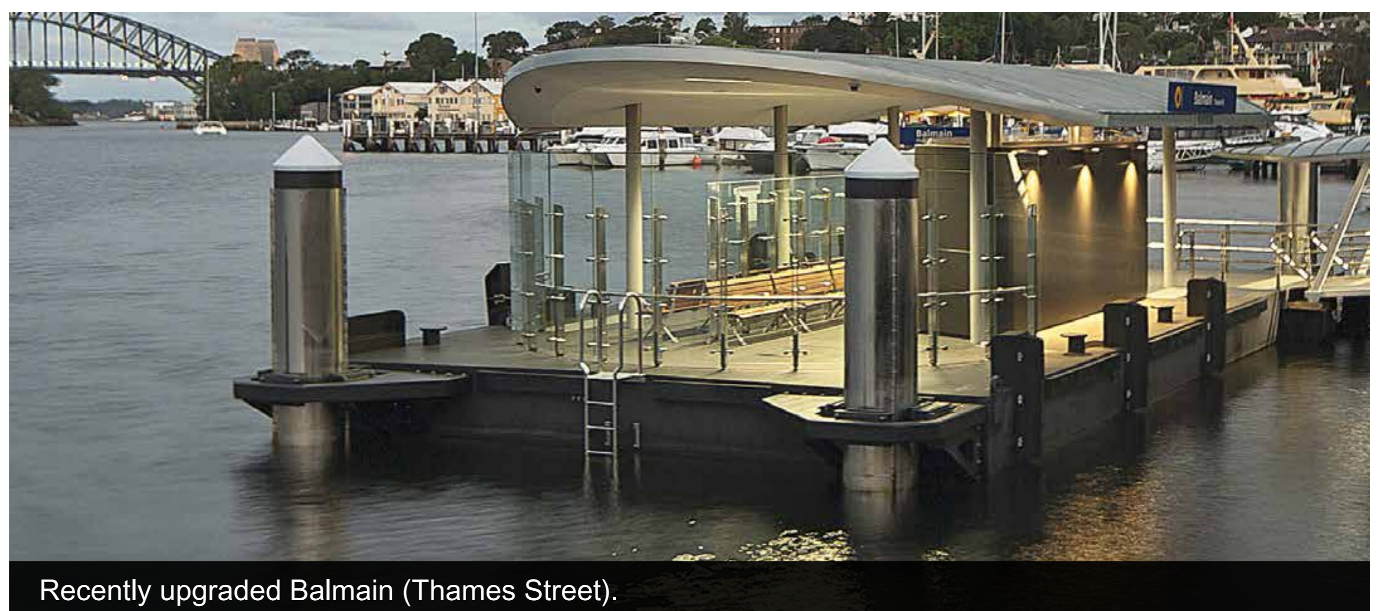
Recently upgraded Balmain (Thames Street).

The new wharf will have capacity for two ferries to berth at the wharf at the same time.