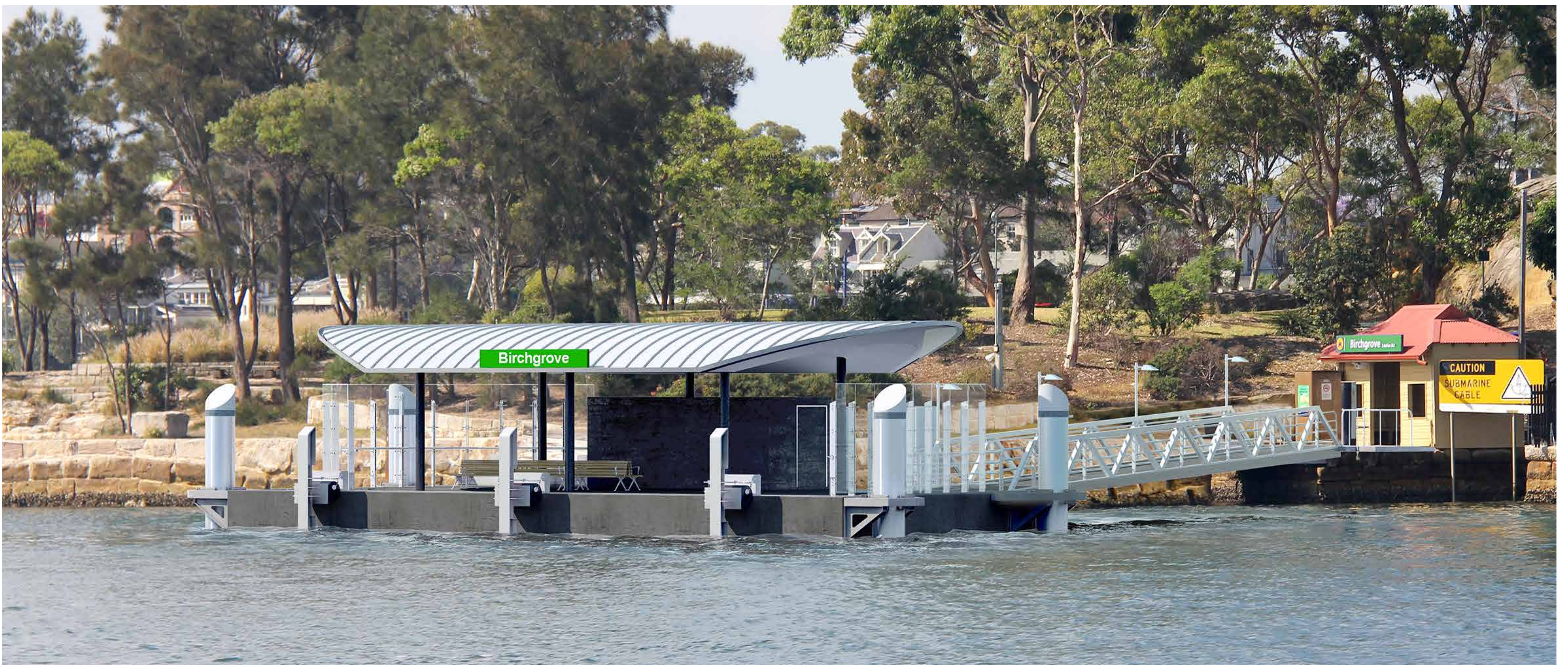
Artist's impression of the proposed new Birchgrove Wharf viewed from the river

The upgraded wharf is designed to provide customers with an improved public transport experience.