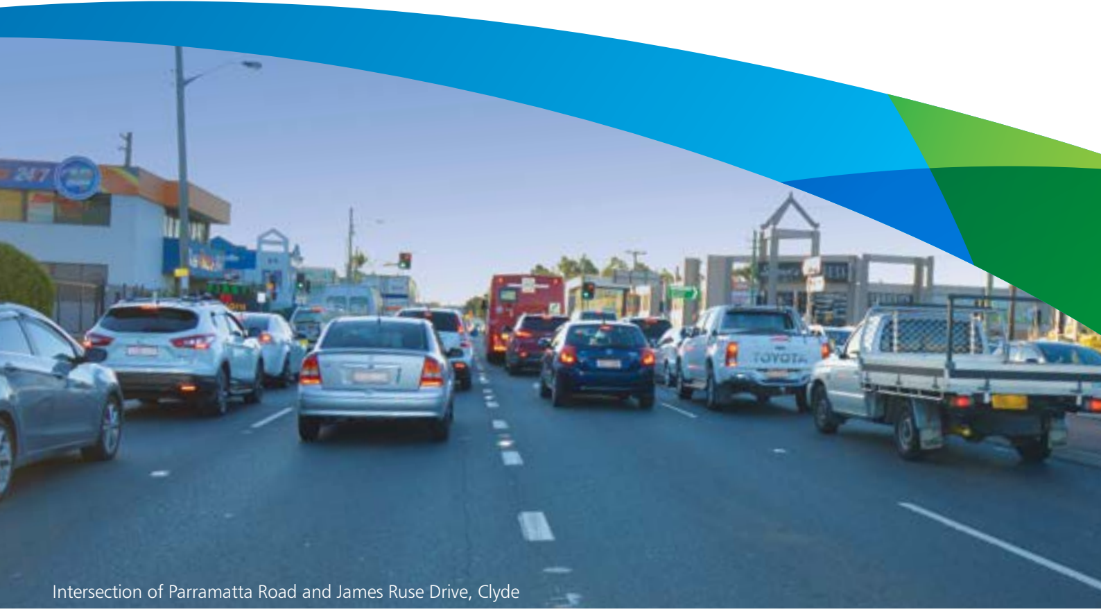
Intersection of Parramatta Road and James Ruse Drive, Clyde