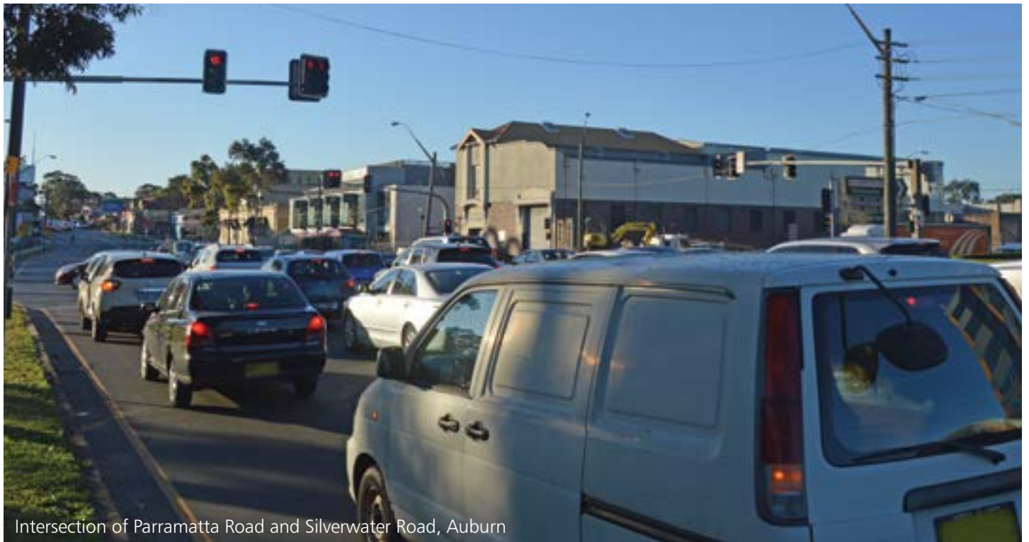
Intersection of Parramatta Road and Silverwater Road, Auburn

This document contains important information about road projects in your area. If you require the services of an interpreter, please contact the Translating and Interpreting Service on 131 450 and ask them to call the project team on 1800 677 700 . The interpreter will then assist you with translation.