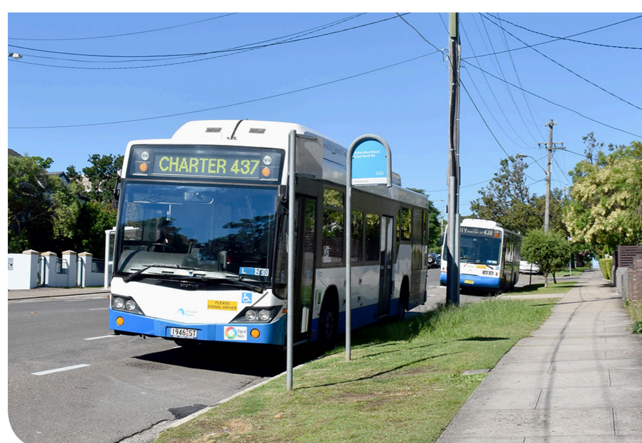
Bus stop at Abbotsford