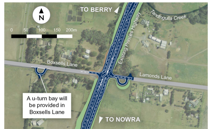
New Boxsells Lane u-turn bay

In response to feedback received about noise and visual impacts in the vicinity of Tandingulla Creek Bridge, the proposed highway geometry will be modified to reduce these impacts on affected residences. Roads and Maritime will also include fauna friendly features in the bridge designs at Flying Fox Creek, Jaspers Brush Creek and Wileys Creek.