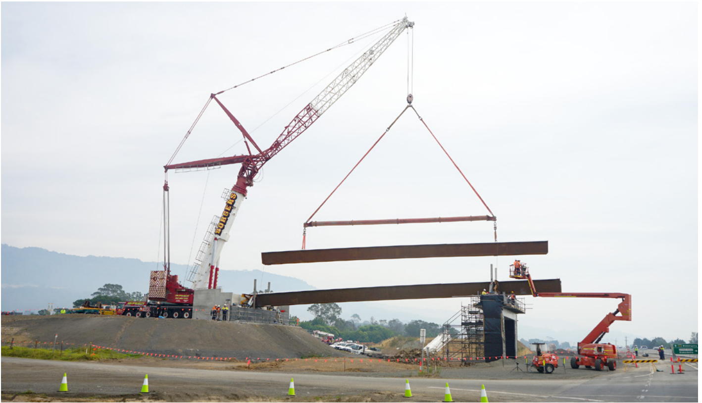
An Australian weathering steel bridge girder being lifted into place