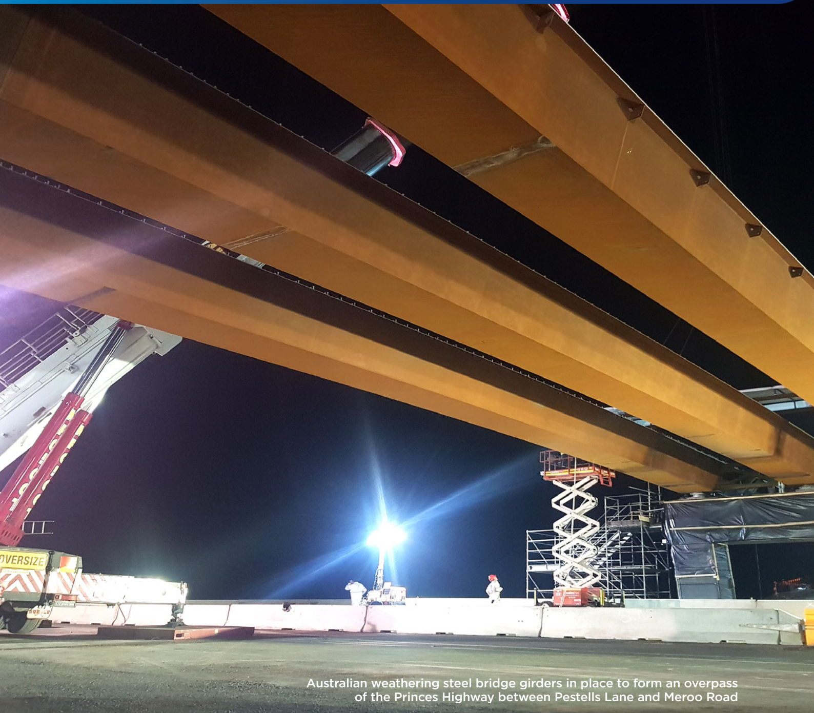
Australian weathering steel bridge girders in place to form an overpass of the Princes Highway between Pestells Lane and Meroo Road