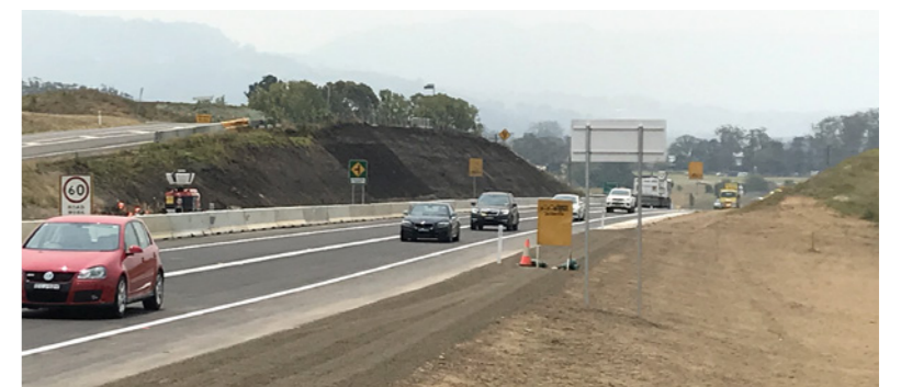
Traffic on the new carriageway between Mullers Lane and O'Keefes Lane

This will allow work to begin on upgrading the old section of highway and Croziers Road intersection.