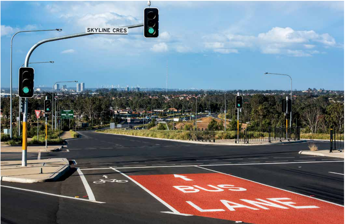
Bringelly Road upgrade – stage 1 from Skyline Crescent looking east towards Liverpool