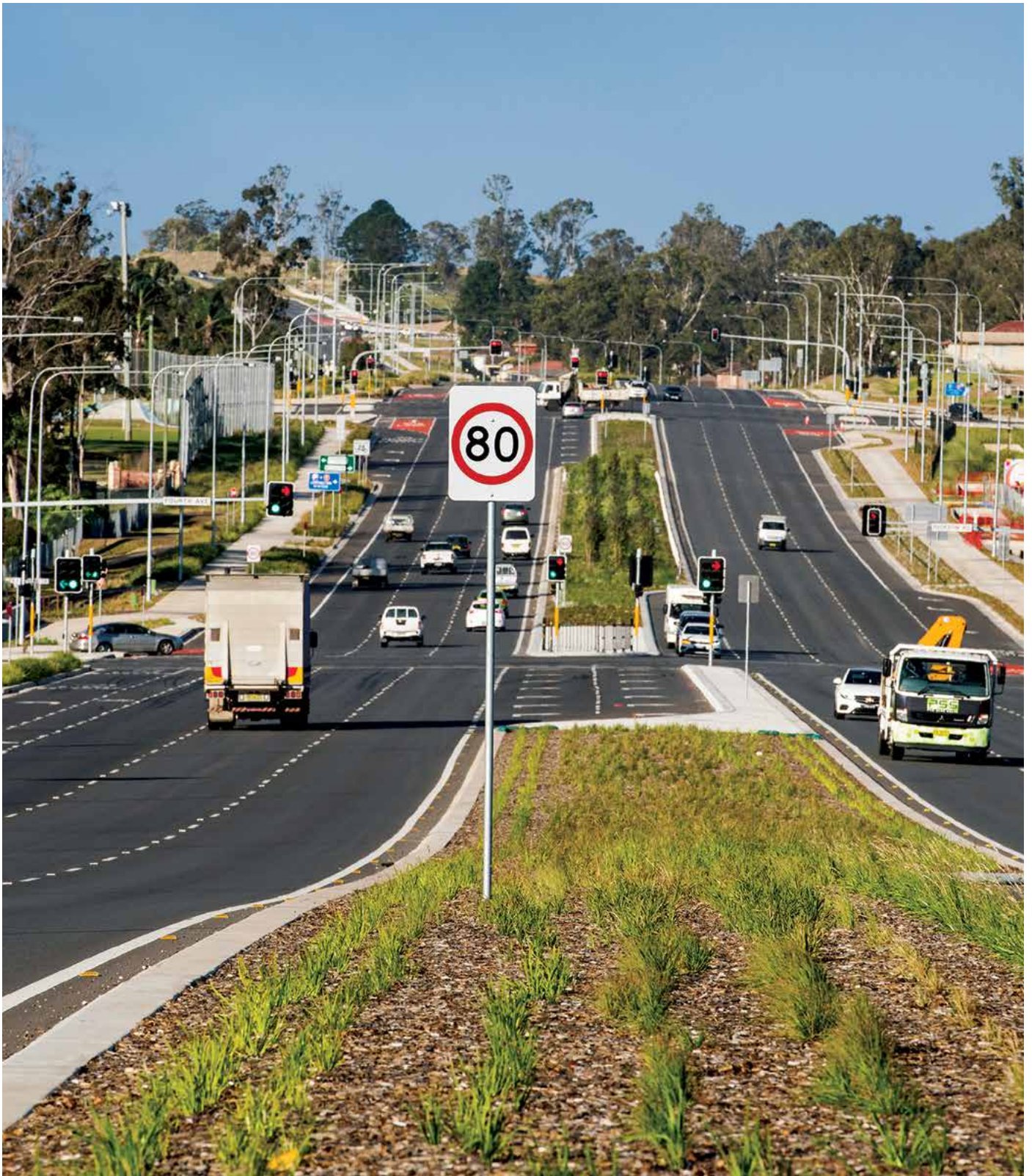
Bringelly Road upgrade – stage 1 from Fourth Avenue looking east towards Edmondson Avenue