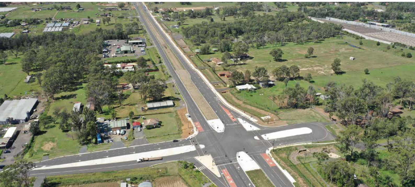
Bringelly Road upgrade stage 1 from King Street looking east towards Leppington

Roads and Maritime Services | November 2019