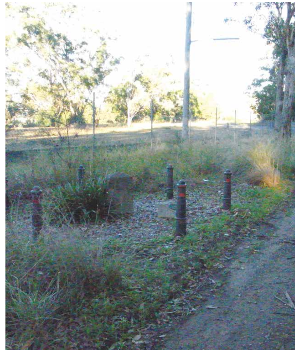
Historical Milestone: Near Macdonald Road