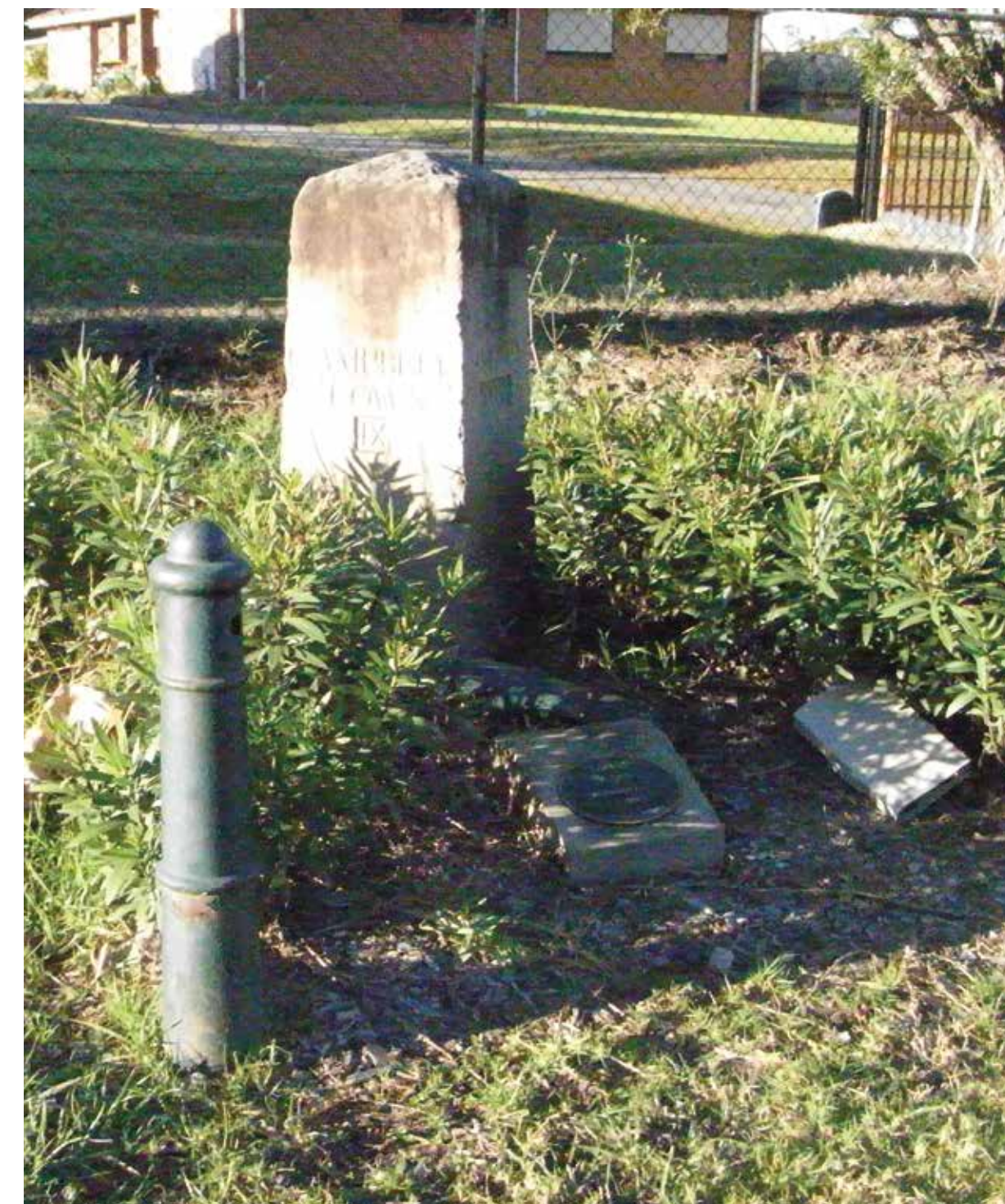
Historical Milestone: Near Glenfield Road