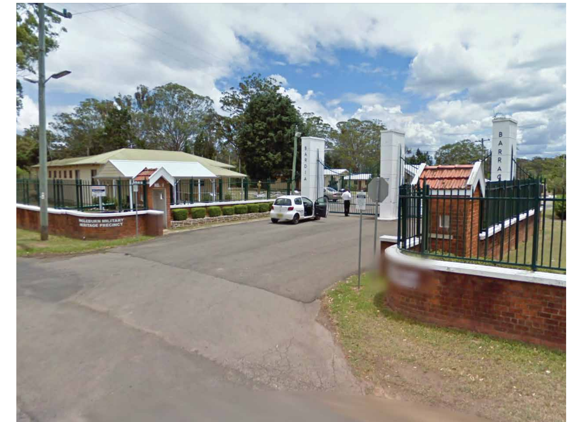
Entry to Bardia Barracks (Google maps) - not impacted