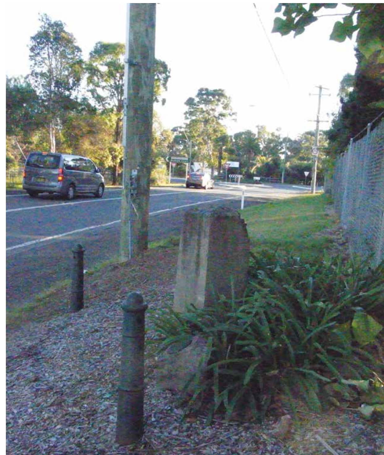
Historical Milestone: Near Denham Court Road