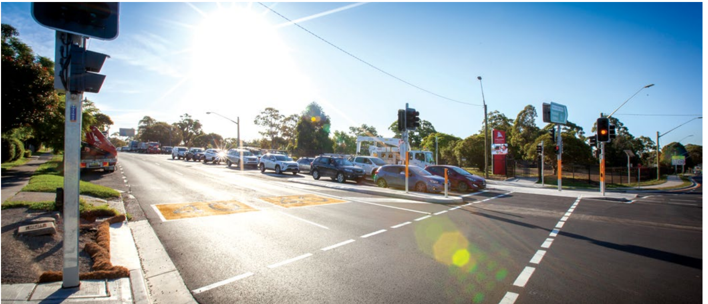
Intersection improvements on The Boulevard as it approaches Taren Point Road

Transport for NSW has recently completed improvements to the intersection of Taren Point Road, The Boulevard and Captain Cook Drive, Caringbah.