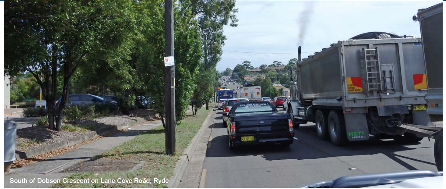
South of Dobson Crescent on Lane Cove Road, Ryde