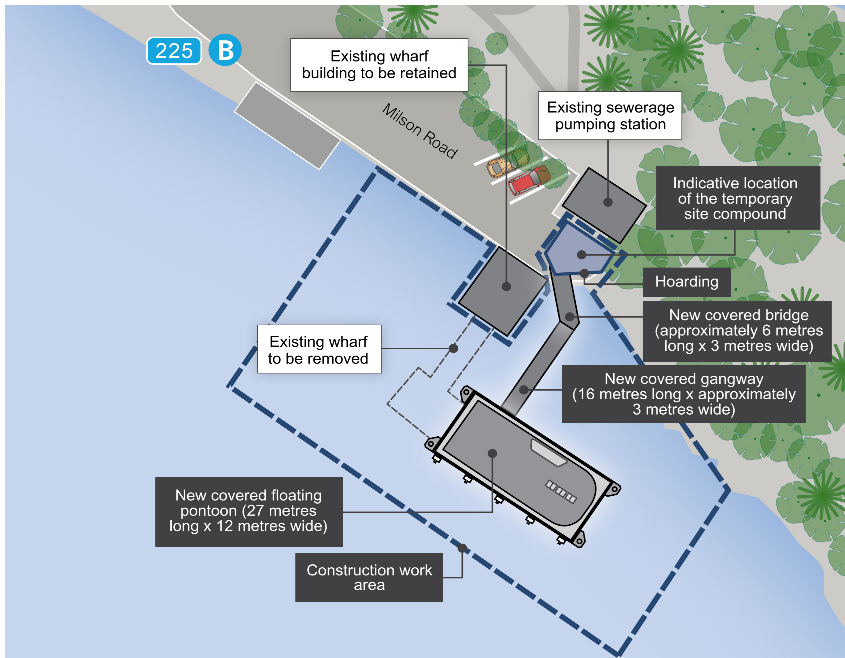
Plan of proposed new Cremorne Point Wharf and likely location of site compound.

The Cremorne Point Wharf upgrade will take about five months to complete, weather and maritime conditions permitting. The existing wharf will be closed and ferry services will cease during construction.