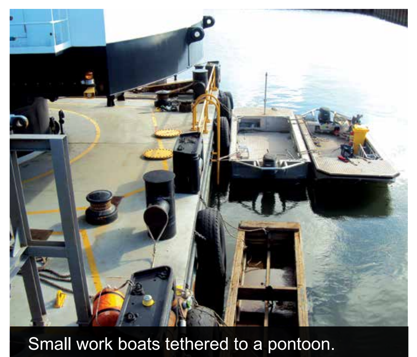
Small work boats tethered to a pontoon.