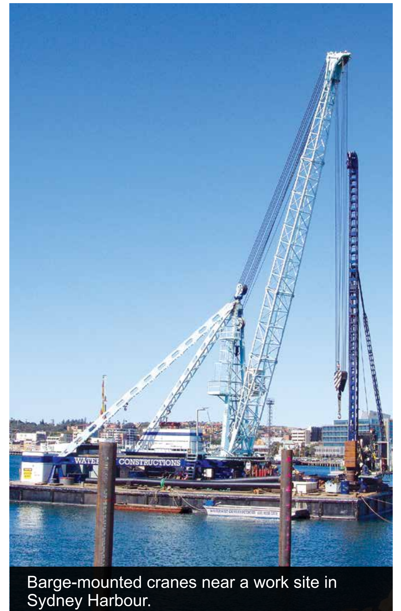
Barge-mounted cranes near a work site in Sydney Harbour.

Water-based construction vessels including a piling barge, barge-mounted cranes and rigs, service barges and small work boats will be used during the upgrade work.