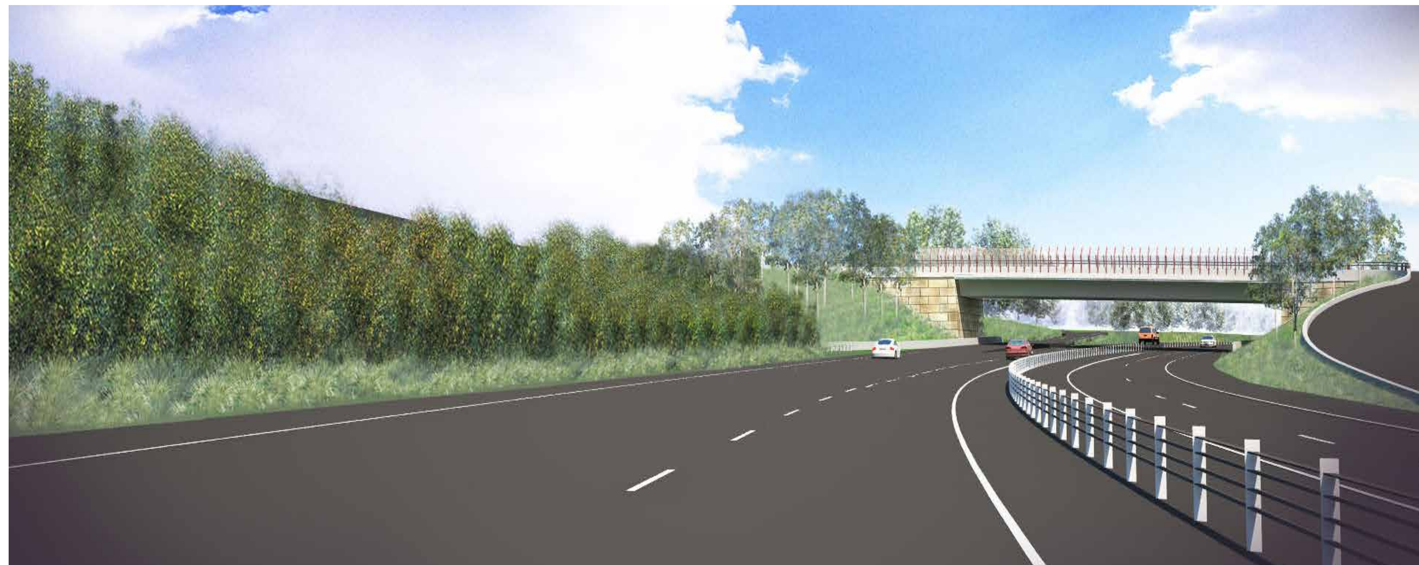
Artist's impression – part noise wall/noise mound option looking north