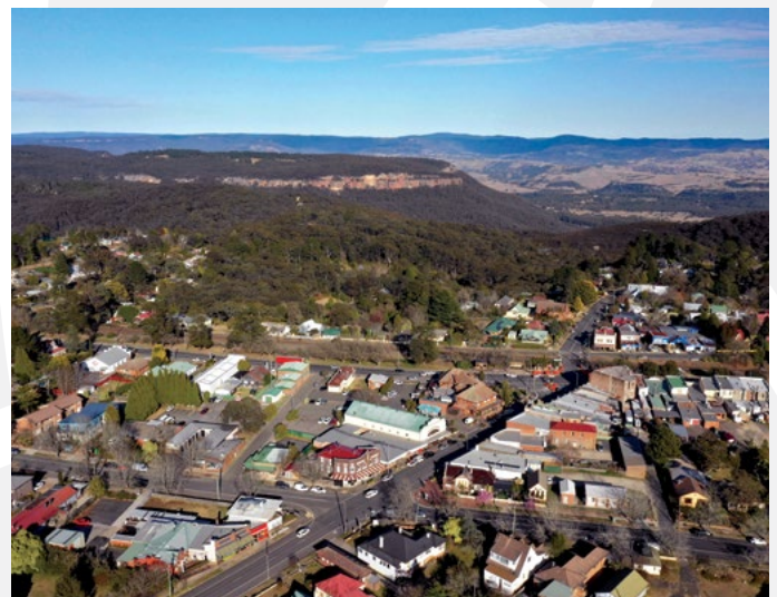
Blackheath looking towards the Great Western Highway

We invite nominations from community members interested in joining the BCC. For more information please visit nswroads.work/greatwesternhighway