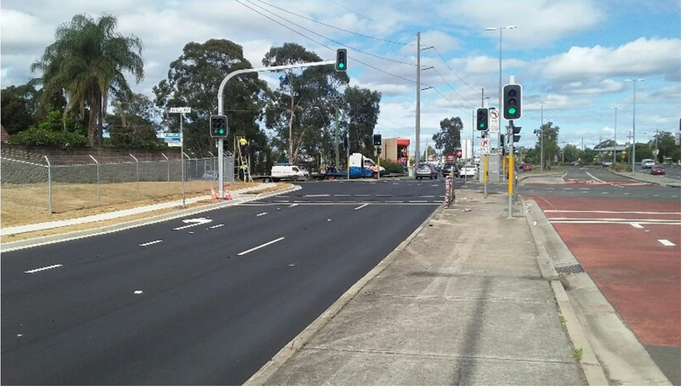
Completed intersection improvements at Hoxton Park Road and Hill Road, Lurnea