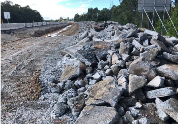
Piles of broken concrete ready to be crushed