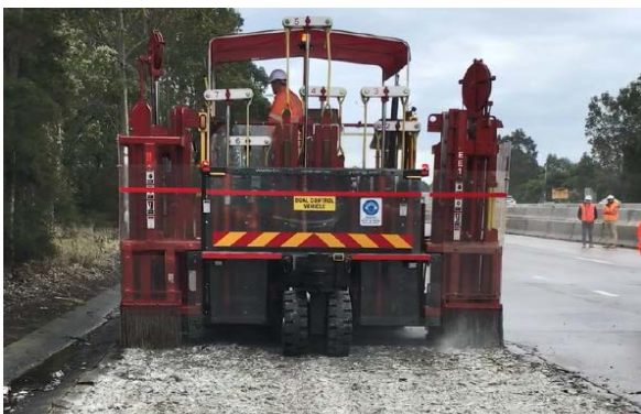
Rubbeliser breaking the concrete pavement

This machine is quieter and faster than the traditional ‘hammering’ method used to break up old concrete surfaces.