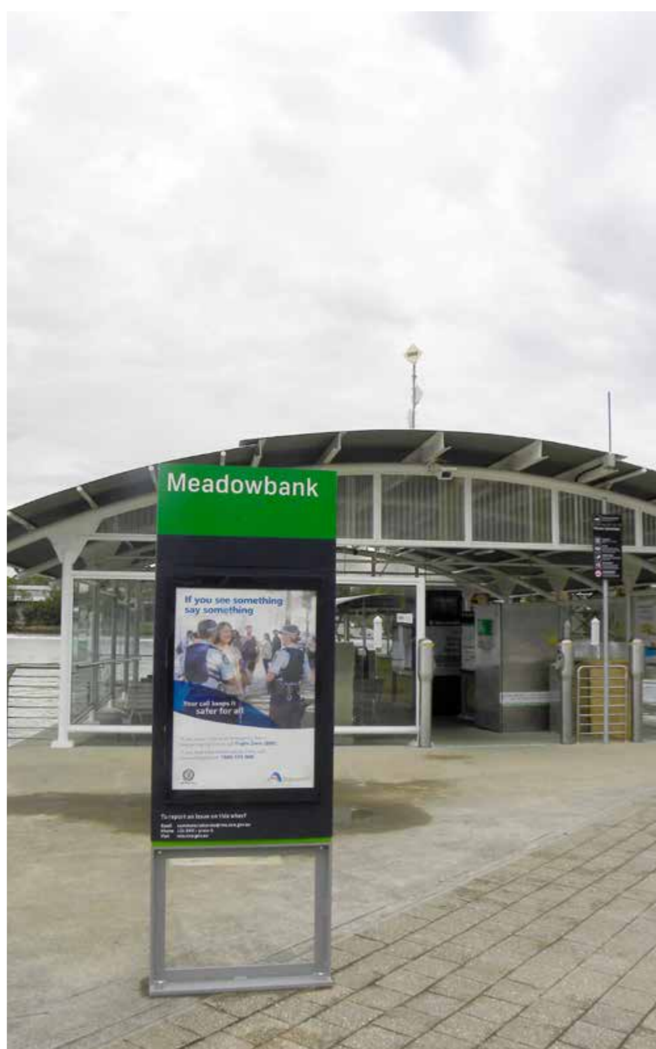
Entry to the existing wharf