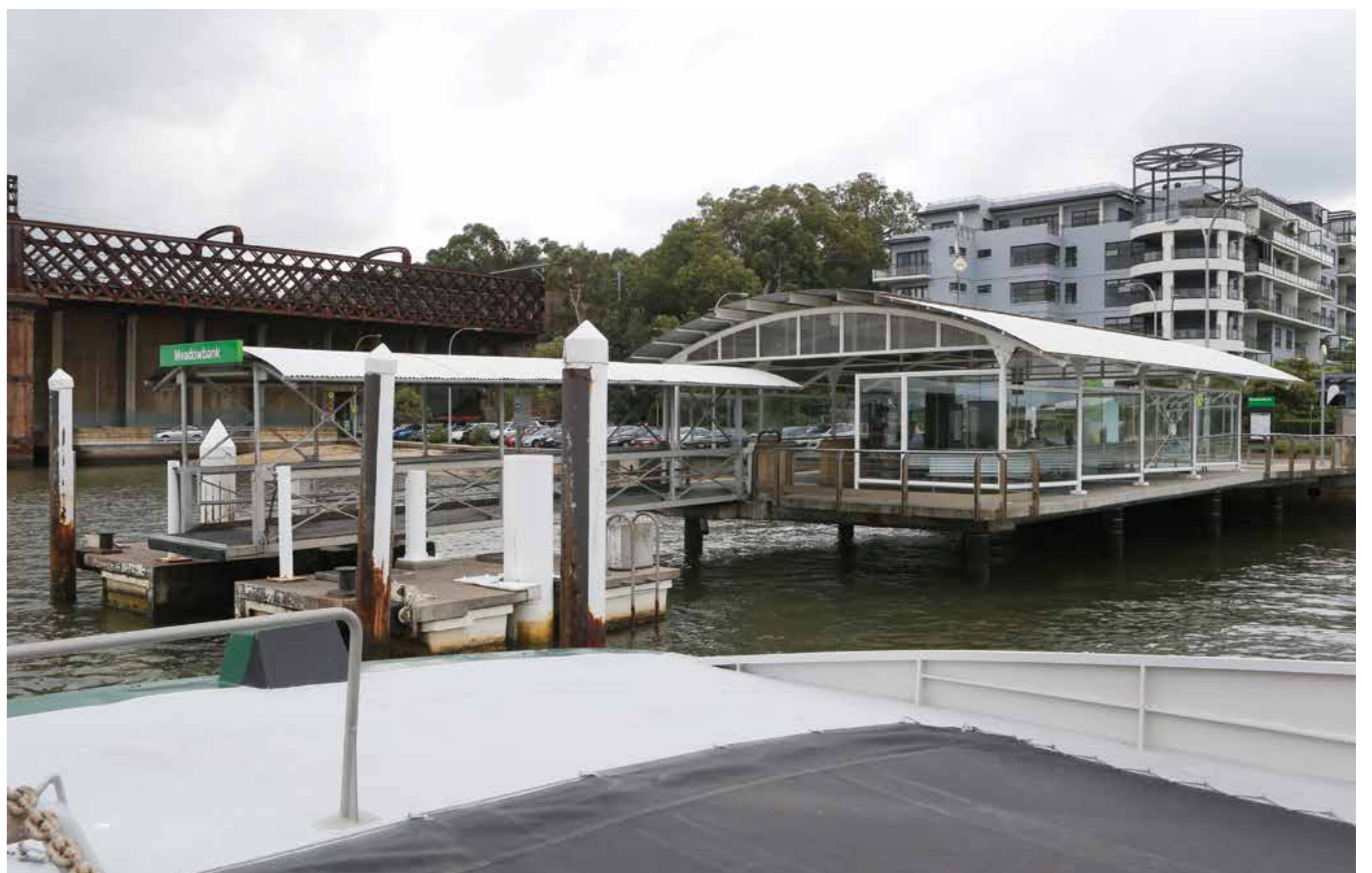
The existing Meadowbank Wharf viewed from the river

Consultation on the wharf and interchange upgrade was carried out in April and May 2015 at Meadowbank. The concept design has taken into consideration feedback from the community and the local operational and environmental conditions.