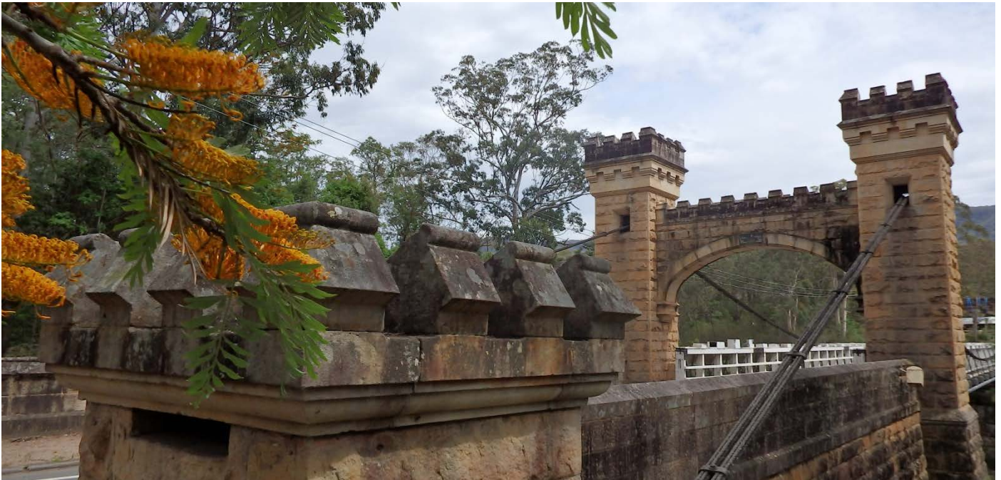
The historic Hampden Bridge was built in 1898.