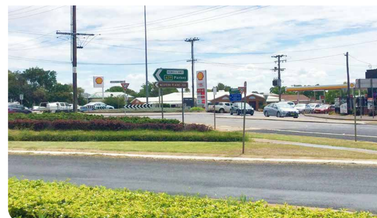
The existing intersection