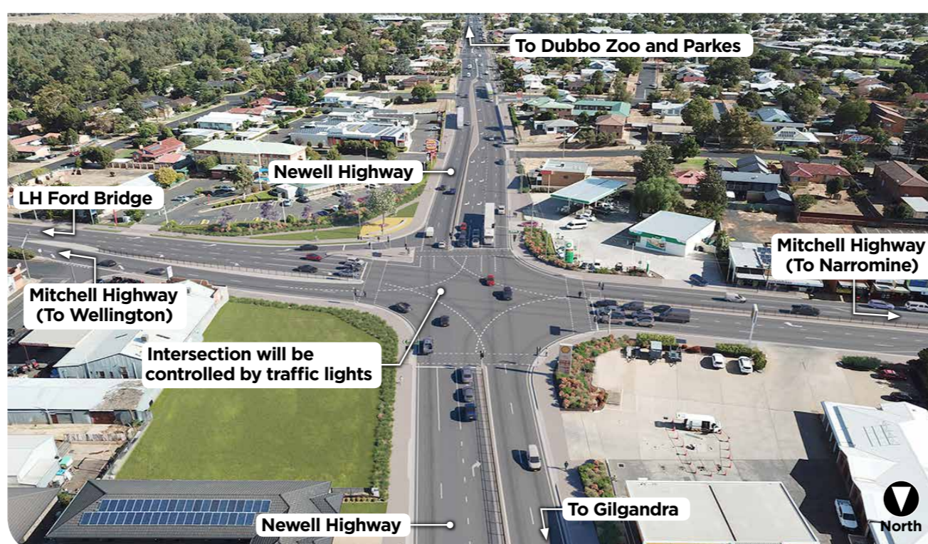
Artist's impression of the Newell Highway and Mitchell Highway intersection