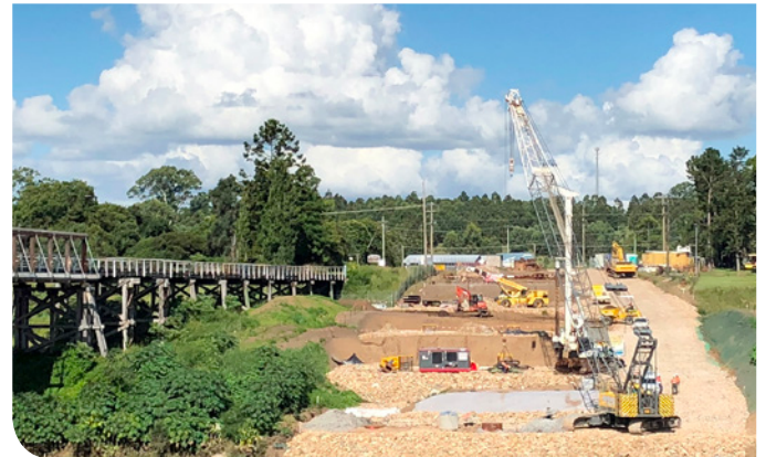
Building the new Tabulam Bridge on the eastern side of the river