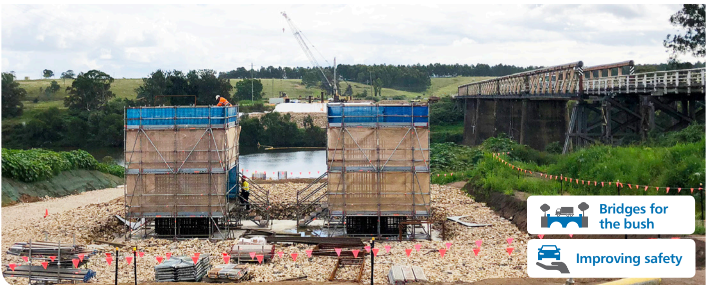
Building the framework for the bridge piers on the new Tabulam Bridge

The NSW Government is funding the $48 million bridge project in Tabulam to improve road safety and efficiency. The project involves building a new 290 metre long concrete bridge, as well as improvements to the road approaches to the new bridge.