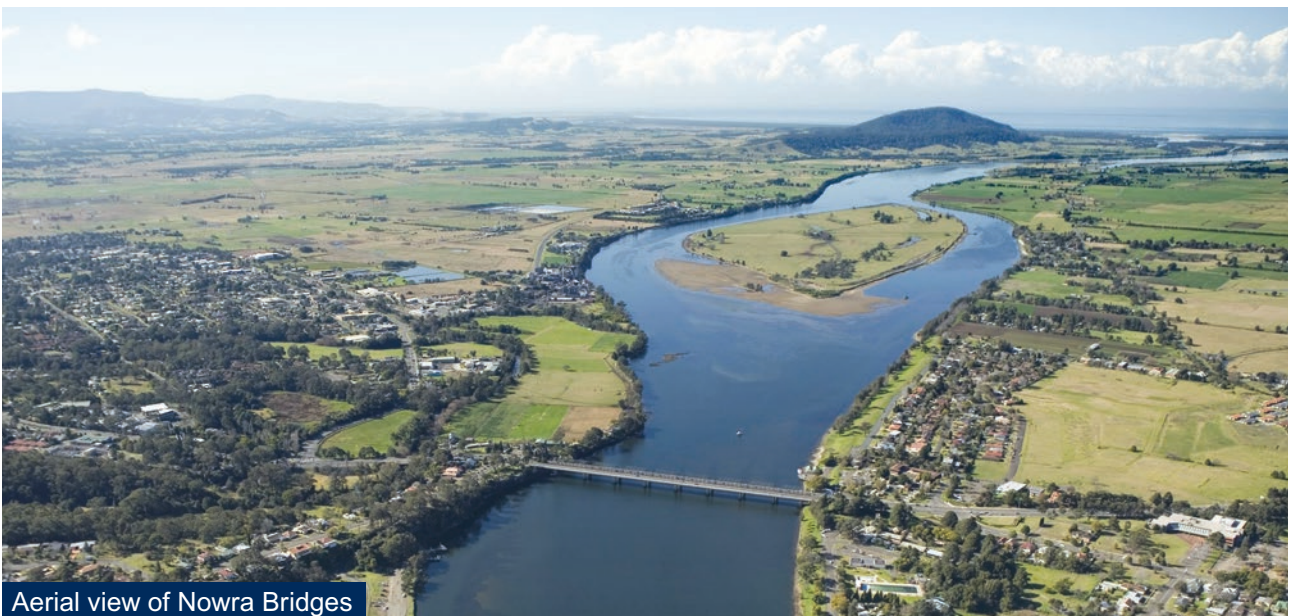
Aerial view of Nowra Bridges

Roads and Maritime Services has started investigations to improve conditions on the Princes Highway over the Shoalhaven River in Nowra. The NSW Government allocated $2 million in 2013-14 to plan for a potential new river crossing.