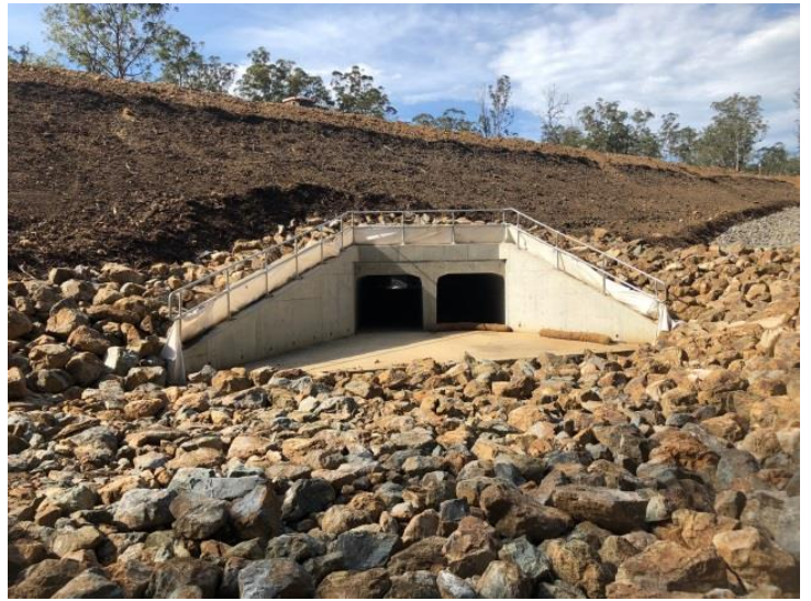
Above: Newly constructed box culvert to improve drainage