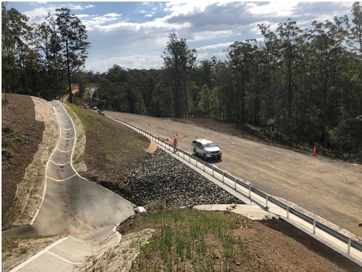
Above: View of the new alignment looking west

Roads and Maritime Services | December 2018