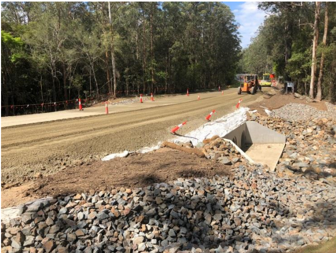
Above: Pavement work at Yippin Creek

We thank motorists for their continued patience during this work.