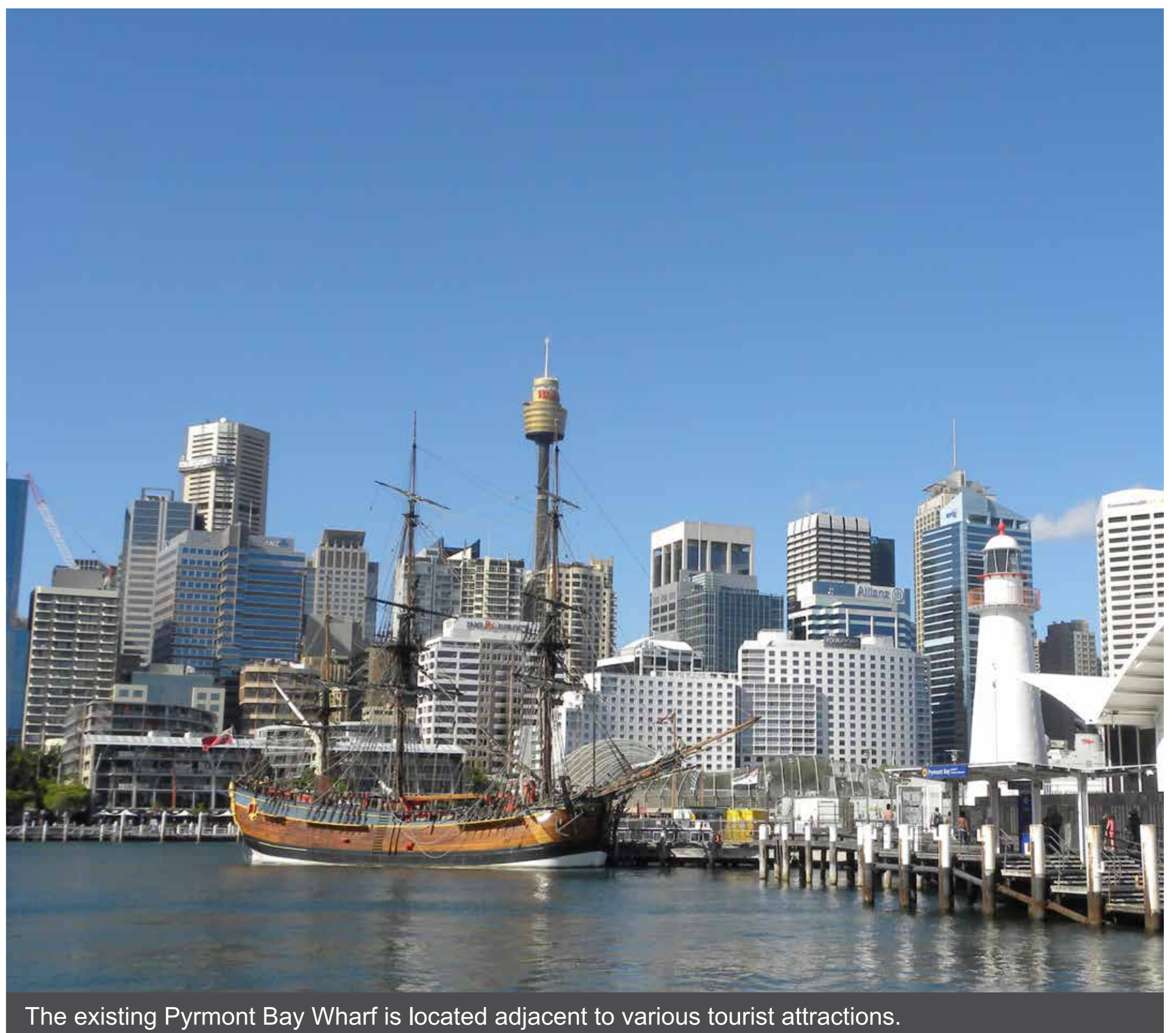
The existing Pymont Bay Wharf is located adjacent to various tourist attractions.

Darling Harbour Ferry Services will recommence when the new wharf opens.