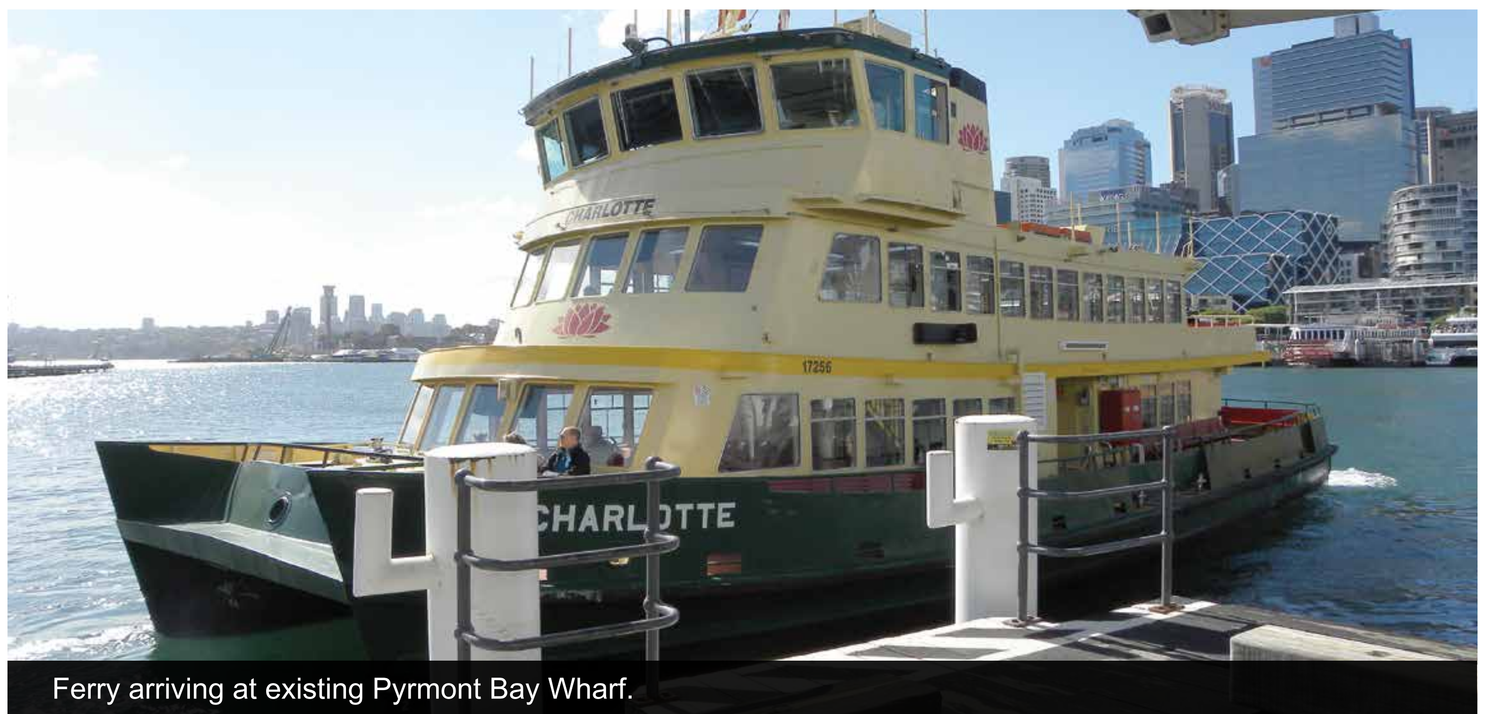
Ferry arriving at existing Pymont Bay Wharf.

All efforts will be made by the project team to reopen the wharf as soon as possible.