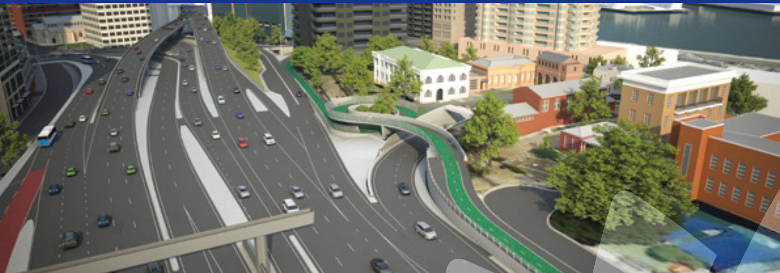
Artists impression of the proposed southern cycleway

The NSW Government is investing in projects to modernise and improve access to the Sydney Harbour Bridge.