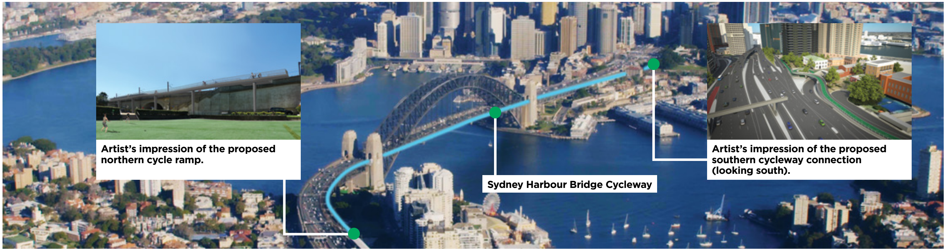
Artist's impression of the proposed northern cycle ramp.