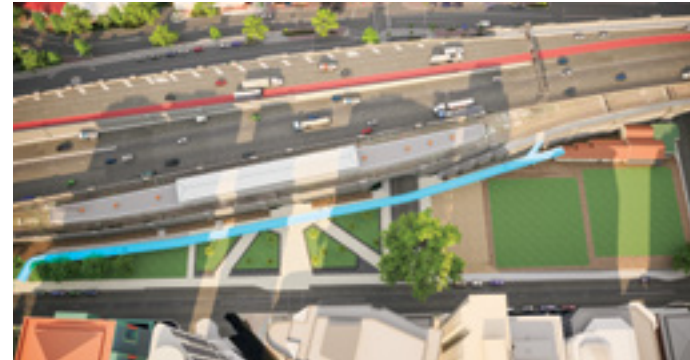
Proposed northern ramp alignment of preferred option.

A preferred alignment option was unanimously recommended as it would: