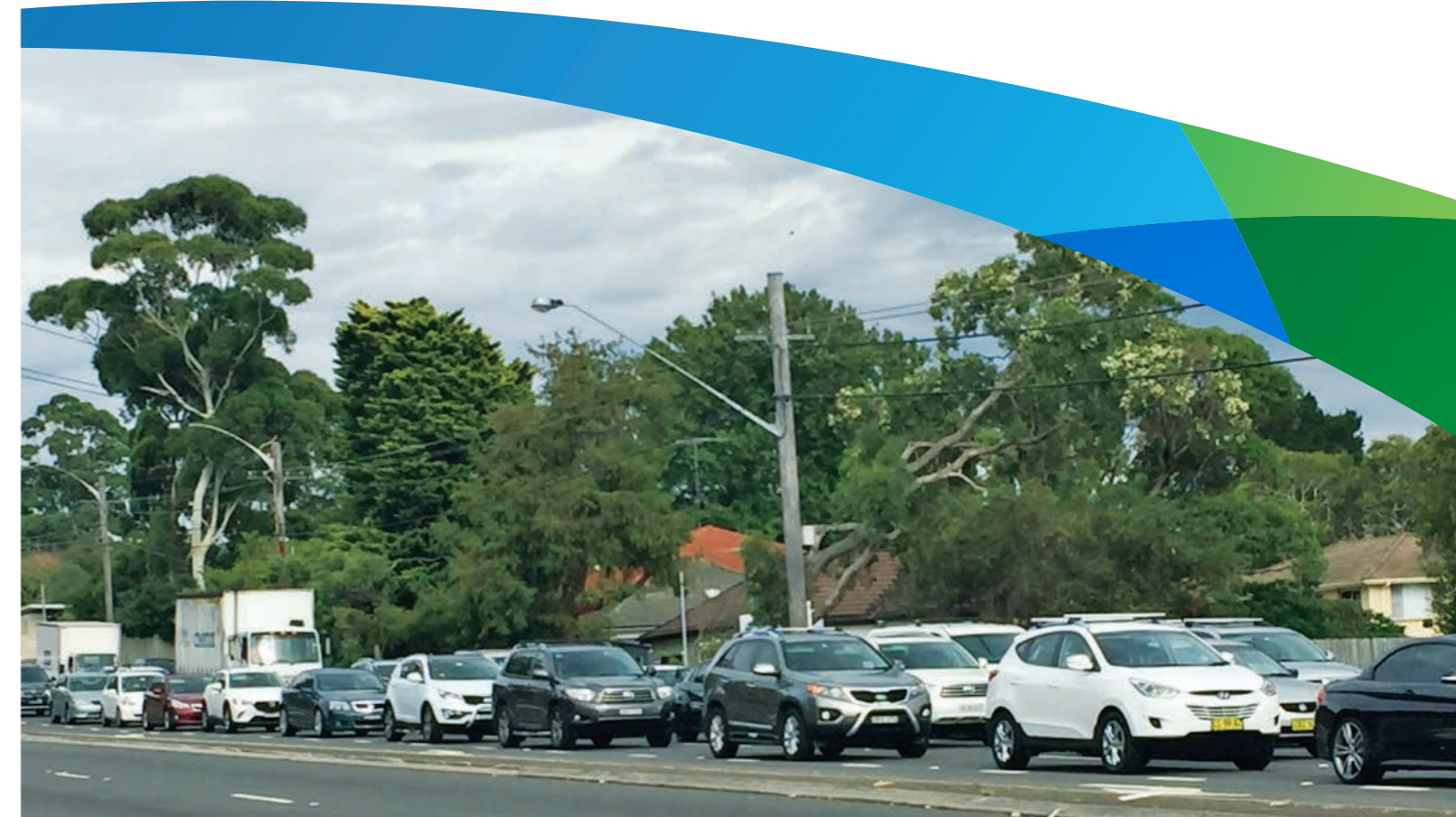
Warringah Road and Government Road, Beacon Hill