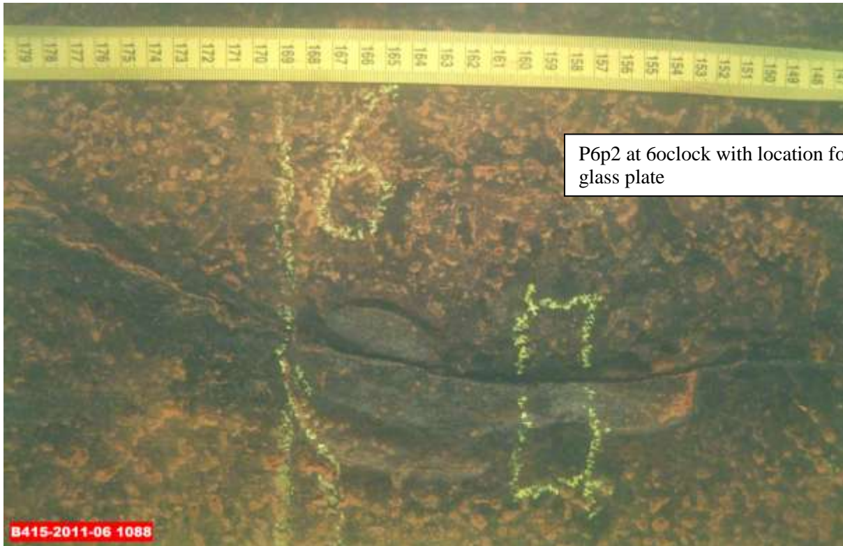
P6p2 at 6oclock with location for glass plate