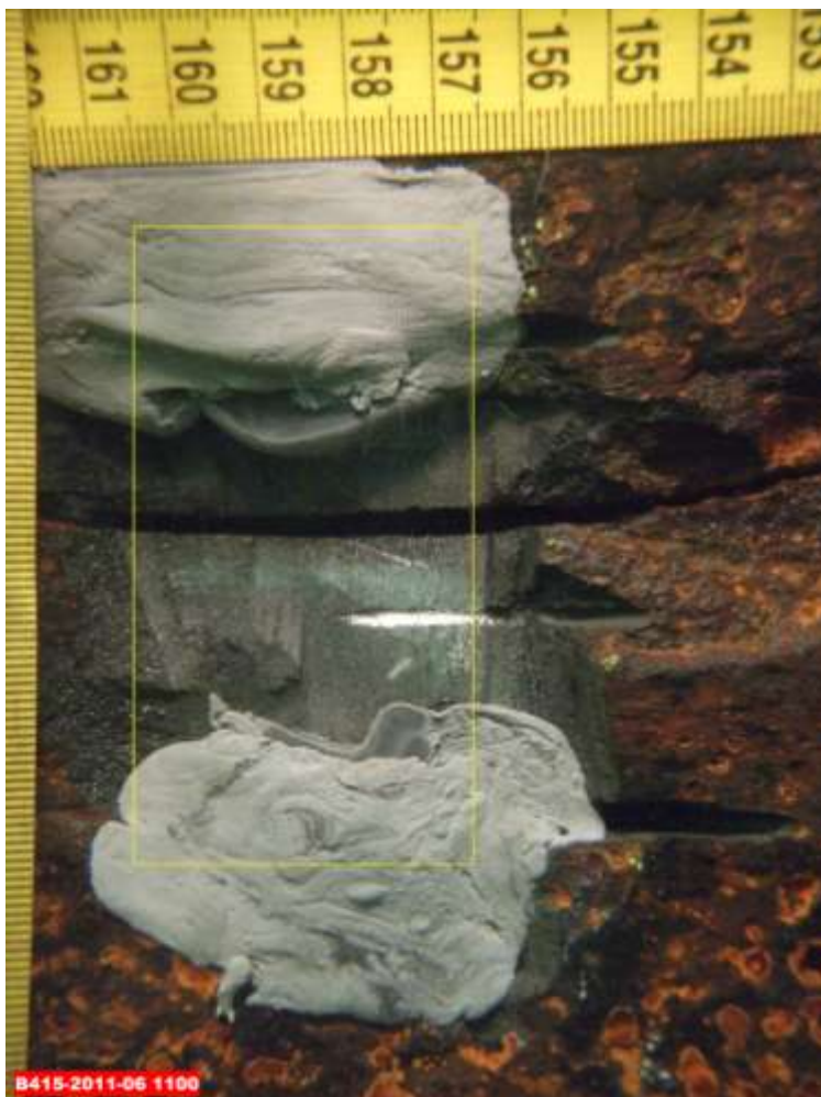
P6p2 with glass plate installed near 6o'clock