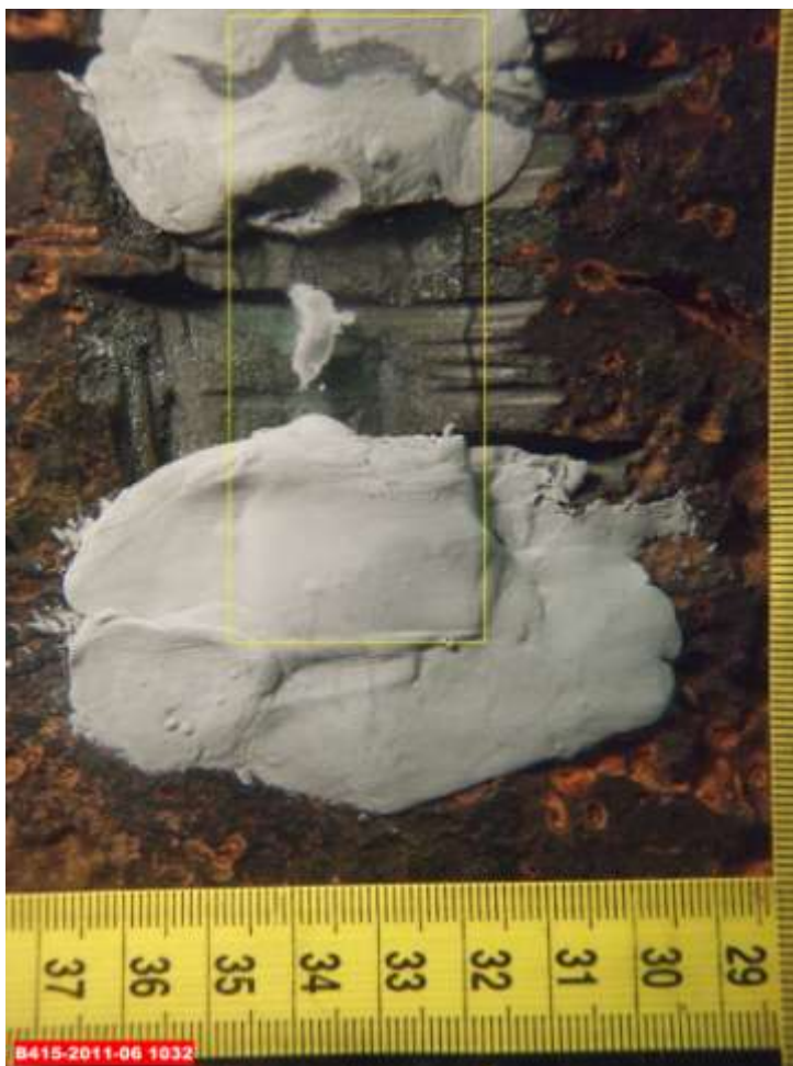
Glass plate on P5p1 at above location