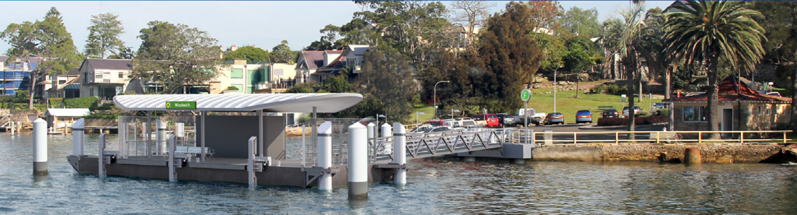
Artist's impression of the new Woolwich Wharf viewed from the water

The NSW Government is improving Woolwich Wharf as part of the Transport Access Program – an initiative to deliver accessible, modern, safe transportation. Woolwich Wharf will be temporarily closed from Wednesday 10 June 2020 for about five months, weather permitting. Ferry services will operate to Clarke Road Wharf during construction.